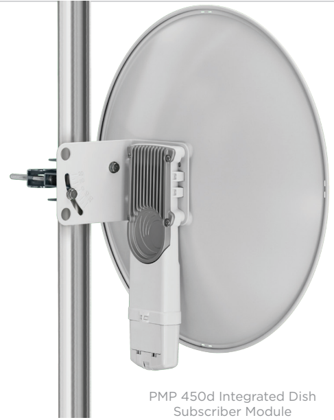
PMP 450d Integrated Dish Subscriber Module